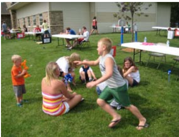
Kids and parents playing games