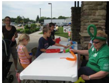
Balloon creations, Mapleton Majors 4-H Group