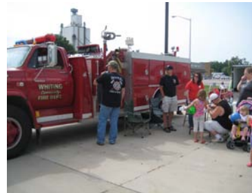
Whiting Fire Department