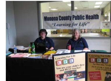
Learning for Life Program Educators