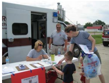
Burgess Health Center Ambulance