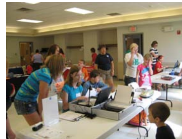
Child ID Cards by New York Life